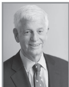
Mario J. Gabelli, CFA Chief Investment Officer