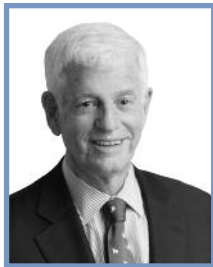
Mario J. Gabelli, CFA Chief Investment Officer