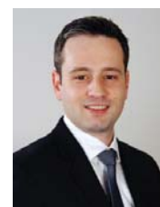
JOSEPH GABELLI Portfolio Manager