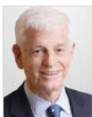
MARIO J. GABELLI, CFA Chief Executive Officer GAMCO Investors, Inc.